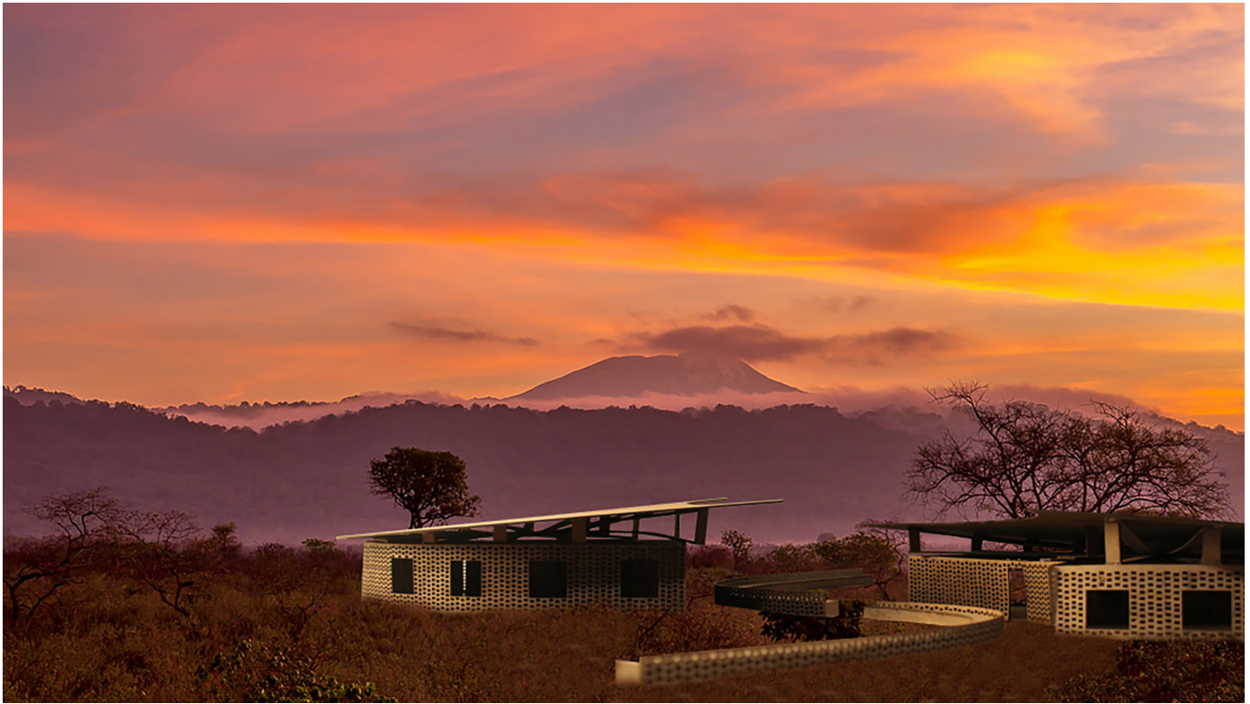
Figure 3: Rand Abu Al-Shar - Model Photo of Arts Complex in Tanzania for the Tanzania School Foundation photoshopped into the site

collaborating with our studio to see what types of creative solutions would emerge that she could then take to the Ethiopian Ministry of Education as they developed a new typology of school for early childhood education. She hoped that by presenting many possibilities, the Ministry might see possibilities beyond their current building standard.