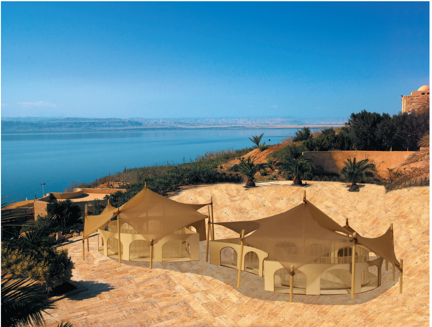
Figure 5: Rand Abu Al-Shar - Model Photo of Arts Complex adapted to the climate in Jordan and photoshopped into a hypothetical site

there were concerns expressed about the future of the non-profit without a shift toward more empowerment of the local community and vision.